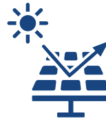
2.1 GW Solar Glare Assessments