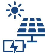
Large-scale Integrated Solar and BESS Project and Construction Management