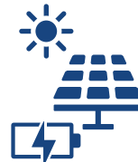
Large-scale Integrated Solar and BESS Project and Construction Management