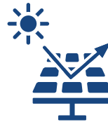
2.1 GW Solar Glare Assessments