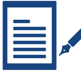
10 GW Commercial Contracting

Solas Energy® is equipped to support developers, investors, and industry market players to evaluate, develop, execute, and manage key contractual agreements within the renewable energy sector. Solas Energy has over 20 years of experience managing key agreements, including power purchase agreements (PPA) and turbine supply agreements (TSA) across multiple jurisdictions and regions throughout North America.