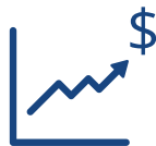
Return on Investment Analysis for Large Corporations