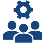
20+ years SPCC Plan experience