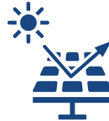
1.6 GW Solar Glare Assessments